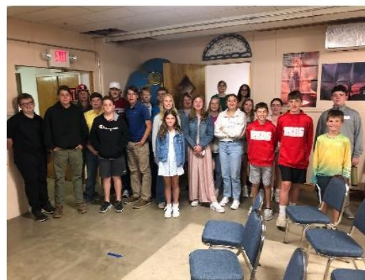
JR HIGH CONFIRMATION