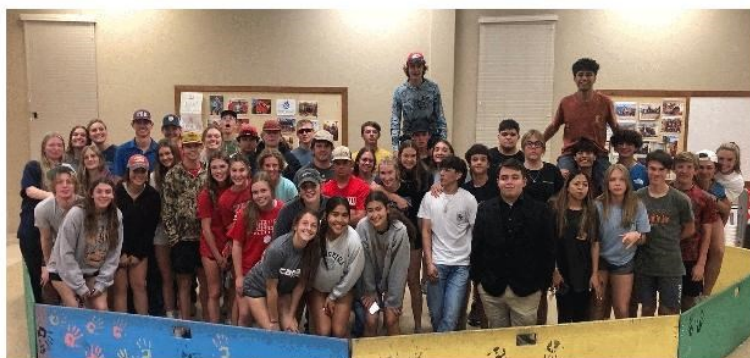
SR HIGH WYWP

East Church Parking Lot via Creek St. Thanks for the support!!