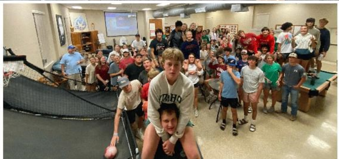
(same wywp group from front & back!)