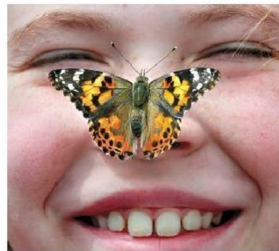
Easter Butterfly Release- March 31 st