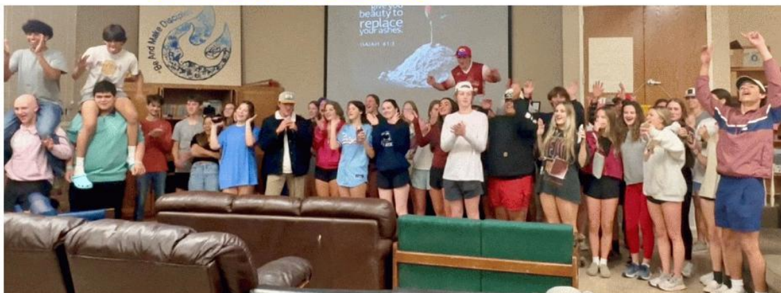
Sr High WYWP- February 21 st