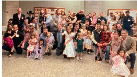
Father Daughter Dance 2024