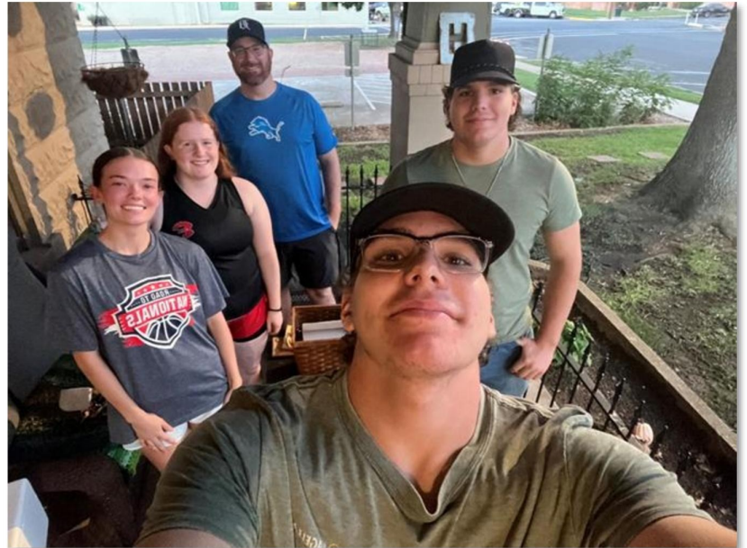
One of our recent High School Bible Study nights!

High School Youth Group QR Code: Scan to register your High Schooler for youth group.