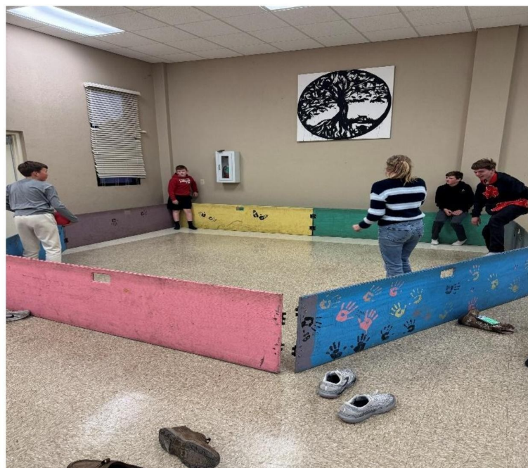
Our middle schoolers enjoying a "non-competitive" game of Gagaball!

We kicked off our new series, "After You", which is all about how we can love others well. We're challenging our teens to figure out ways we can love others in our community, our schools, and in our church.